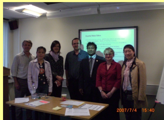
Presenters & some of the participants at the SLS Workshop, Manchester, July 2007